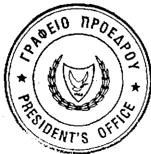
GLAFCOS CLERIDES PRESIDENT OF THE REPUBLIC OF CYPRUS

DONE in Nicosia, this 22nd day of October, One Thousand Nine Hundred and Ninety Eight.